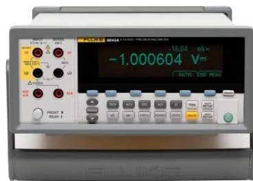
6.5 Digit Multimeter