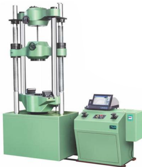
Universal Testing Machine