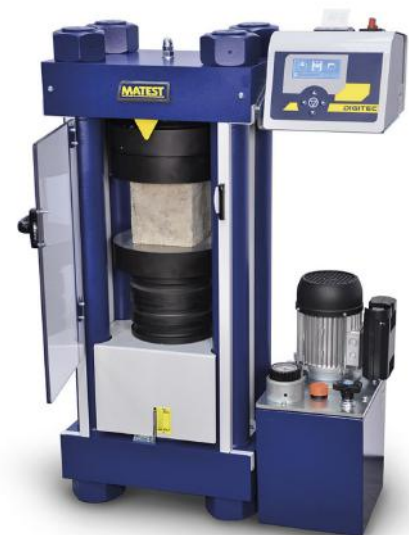
Compression Testing Machine