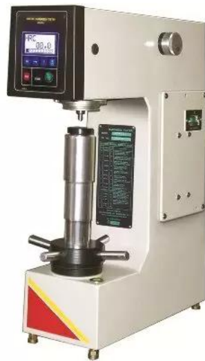
Rockwell Hardness Machine