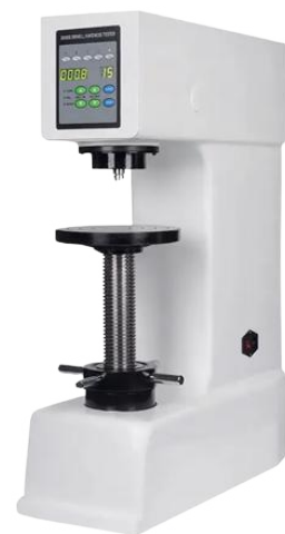
Brinell Hardness Machine